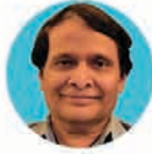
SURESH PRABHU UNION MINISTER OF COMMERCE & INDUSTRY