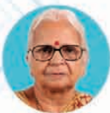
MRIDULA SINHA GOVERNOR OF GOA