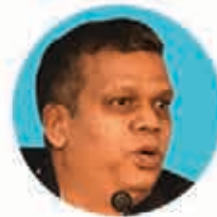
LOKNATH BEHERA DGP, KERALA POLICE