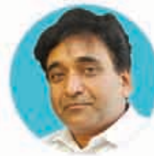
RAJESH AGGARWAL JOINT SECRETARY MINISTRY OF TRIBAL AFFAIRS GOVERNMENT OF INDIA