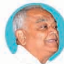
RANJAN DWIVEDI EX-DGP, UP AND ADVISOR (CYBER SECURITY), MINISTRY OF POWER, GOVERNMENT OF INDIA